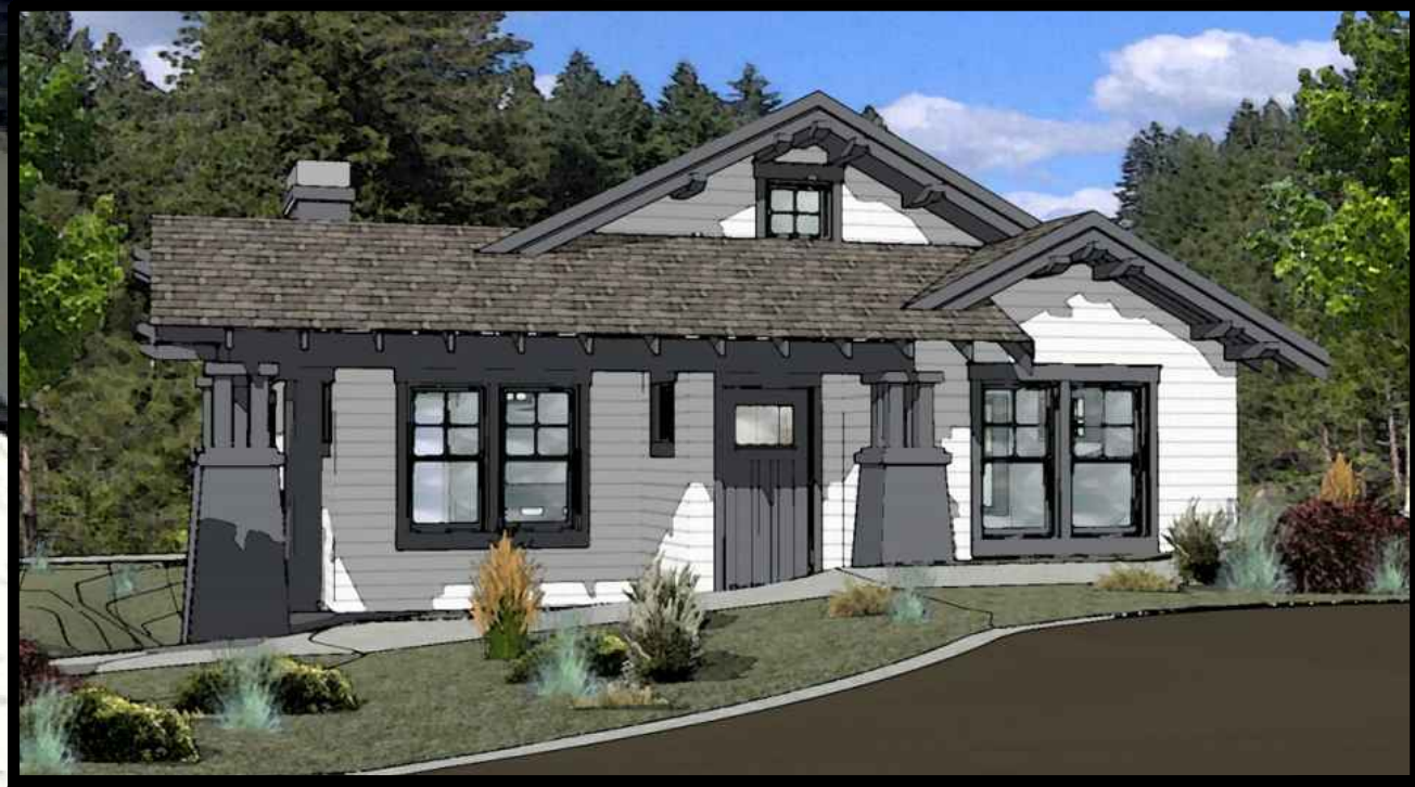
TYPICAL ARCHITECTURAL STYLE AND BUILDING DESIGNS