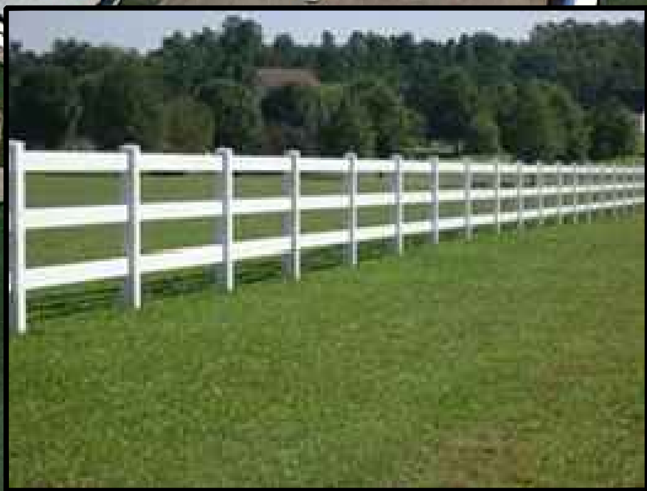
3 RAIL VINYL FENCE